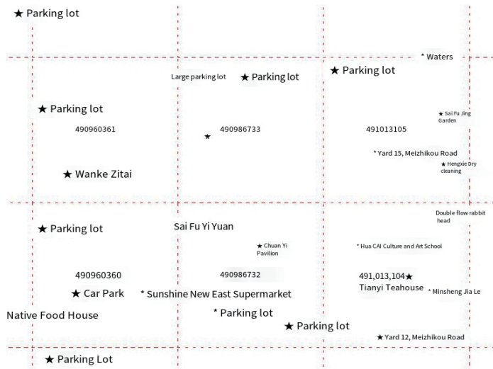
Figure 2 Grid instance

FIG. 3 shows the example of Voronoi diagram generated after a single grid calculation: