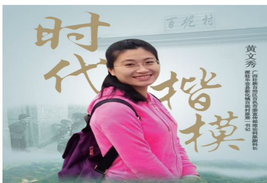
Figure 1: The knowledge points involved in Huang Wenxiu’s

works of PS character propaganda posters are -- matting, selection processing, material color adjustment, etc. The tools involved are -- pen, lasso, brush, movement, eraser, text, color level, color balance, hue/saturation, alignment, etc. As a professional course teacher, these are very simple, but not easy for students, because can do does not mean can do well! When I realized this, it was when I learned 3Done (modeling software for 3D printing majors), and my colleagues who majored in 3D printing told me that “this software is super simple...” . But I can’t draw a simple five-pointed star with the software! It took me a lot of repetitions (Figure 2).