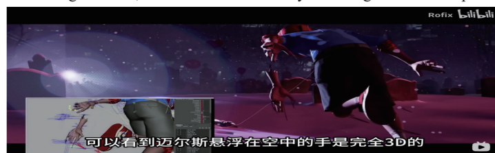
Figure 2- Schematic of Miles' hand

Miles' hand in the air is completely 3D, and the number of frames the camera moves is different from the number of frames the character animates, which is already 12 frames per second in the 3D software (see Figure 2). To match this animation, SONY has developed an interpolate Maya plugin that interpolate adjacent stitches to interpolate fabric simulations smoothly. In other words, the animator could raise or lower Miles' frame count according to mood, but the fabric was always working at 24 frames per second.