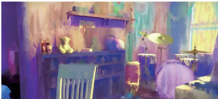
Figure 3- Gwen's Watercolor universe

In Gwen's Watercolor Universe, all the 3D models have been painted with watercolor strokes in the diffuse reflection channel. After experimenting with many original watercolor techniques, Rebelle, a third-party painting software, was the ideal one. It did a good job of simulating the physics of the spread of the watercolor inks, as anyone would expect from Gwen's universe (see Figure 3). But the painting software can't move, it can only draw. To solve this problem, Technical Art created a plugin in Python, a keyspriter-like hijack, that "hijacks" Rebelle's Pointers, so that by drawing a Spline in maya, Rebelle can draw the same pattern at the same time.